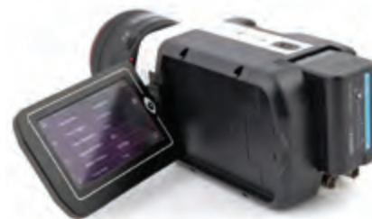
Phantom Miro LC321S with Canon EOS Mount

Just select the one you want with a tap on the screen.