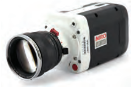
Phantom Miro LAB3a10

Our Miro camera line is supported by Vision Research's Global Service and Support network offering AMECare Performance Services from multiple sites around the globe. Maximize the value of your Phantom camera by learning more about our service and support options at https://www.phantomhighspeed.com/Service-Support/Technical-Support .