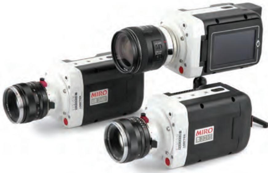
Phantom Miro LAB-, LC- and R-Series Cameras