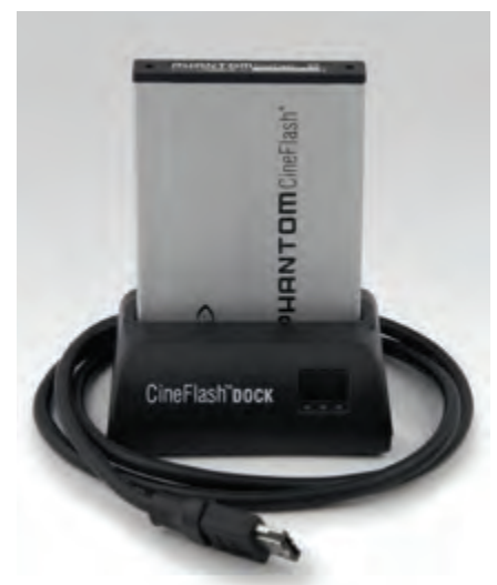
Phantom CineFlash Drive & CineFlash Dock